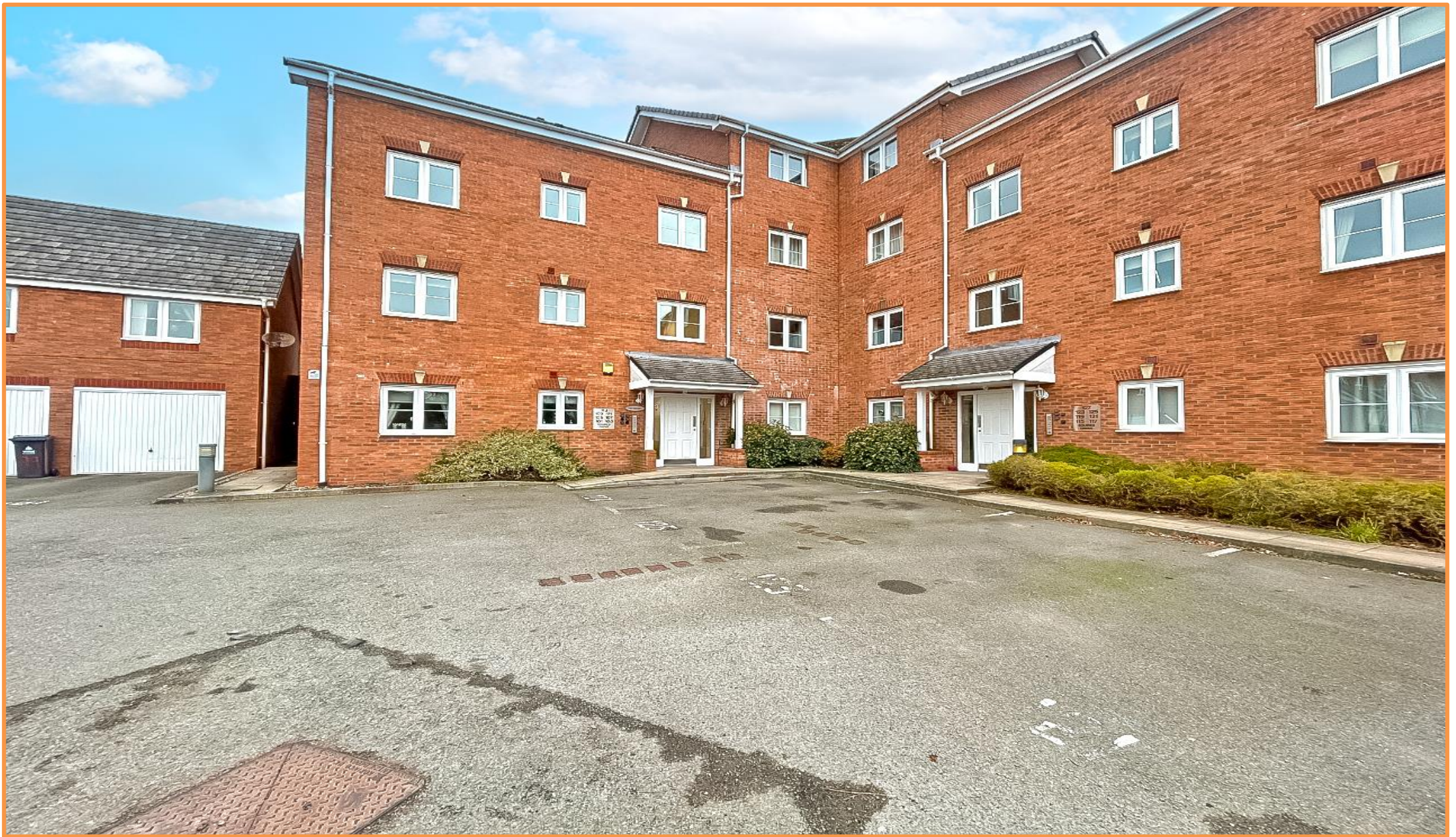
Squires Grove, Willenhall, WV12 5BU